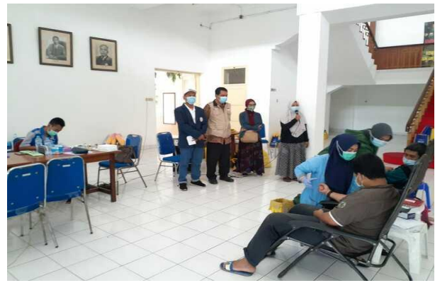
Figure 2. Screening for the convalescent plasma donors