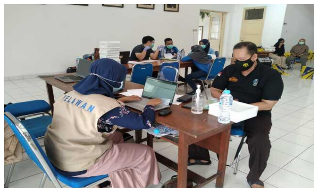
Figure 4. Data Collection for Covid-19 Survivors

Patient Family Assistance Volunteers as facilitators, and Covid-19 survivors especially the alumni of RSLI Surabaya as recipients of the program benefits. The target of this activity was the patient population of Covid-19 patients and survivors from RSLI Surabaya. Samples were taken from the population through the inclusion criteria of willing to participate in the