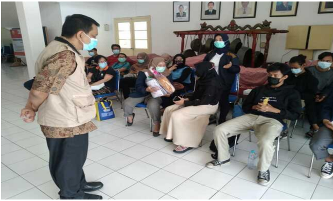
Figure 1. Education on the Benefits of Convalescent Plasma Donation