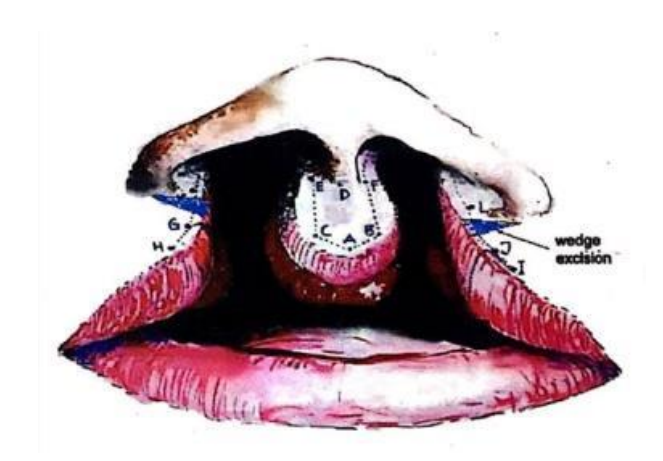
Figure 1. The Djohansjah Bilateral Cheilorrhaphy Technique Design<sup>5</sup>

Point G and J are where the vermilion thinning starts. Point H and I each are 2-3 laterally from PointG and J. Point K and L are where the nostril indentation and vermilion meet. All these points are connected as line AB, AC, CE, and BF. The CE and BF lines are passed into the nose about 1 cm to form the nasal floor. The KG and HG points are connected at the margin of the white line. So are with LJ and JI. From the K and L points, the line is passed into the nose to form the vestibulum nasi<sup>5</sup>.