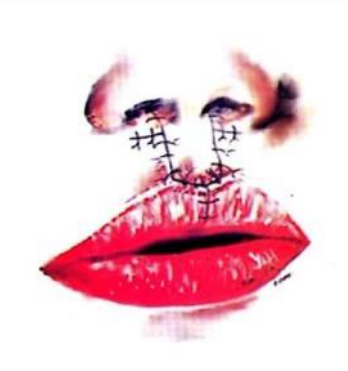
Figure 2. Final Result of Bilateral Cheilorrhaphy<sup>5</sup>

The prolabial skin under the CAB line is dissected and left as a flap which originates at the base of the columella and released from the periosteum. All lateral segments of the muscle and subcutaneous tissue are liberated from the periosteum so that the lateral segments and the