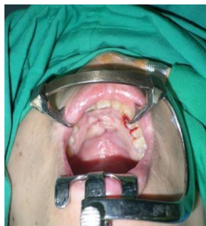
Figure 1. A Fistulae From Palate