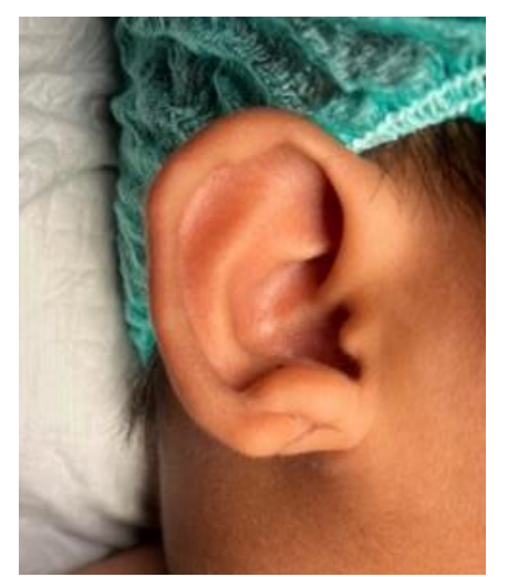
Figure 1. Preoperative of 9-Year-Old Patient's Cleft Earlobe

A 9-year-old boy presented with a right auricular deformity present since birth, with no associated defects. The patient has normal hearing and no discomfort complaints. He faces social consequences including verbal threats from peers and teachers, affecting his social interactions. Clinical examination revealed a complete cleft on the lower third of the right ear, specifically the lobule, without redness or pain. Laboratory tests showed bleeding disorders or other no contraindications. The patient underwent lobuloplasty auricular under general anesthesia, preceded by premedication with cefixime and paracetamol. He was followed up two weeks post-surgery for wound care and to monitor for complications.