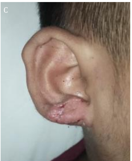
Figure 4. (A) Outcome two weeks postsurgery, (B) pre-suture removal, and (C) post-suture removal