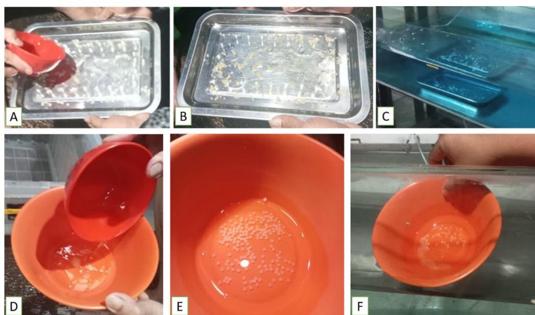
Figure 4. Fertilization process of bronze featherback ( N. notopterus ) eggs to incubation in aquaria; A-C: fertilization to incubation of eggs from the first female using a tray, D-E: fertilization to incubation of eggs from the second female using a bowl.

The containers were gently shaken for 2-3 minutes to ensure uniform fertilization, after which the excess water was removed. The fertilized eggs were then transferred to aquaria for incubation and further development (Figure 4).