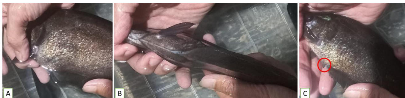
Figure 1. Mature bronze featherback ( N. notopterus ) broodstock; a) lateral view of female, b) ventral view of female, c) male (red circle indicates male genitalia).