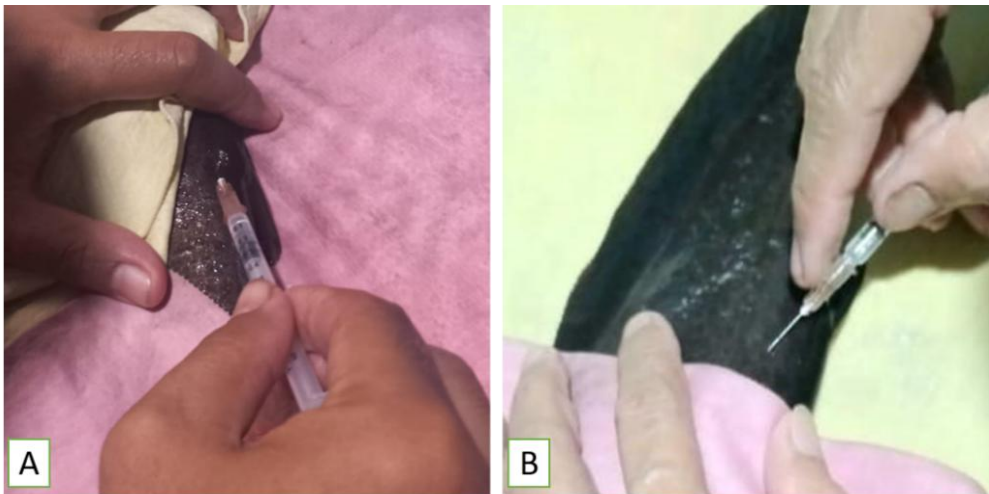
Figure 2. Hormone injection for propagation induction in bronze featherback ( N. notopterus ) administered intramuscularly; a) first injection on the left dorsal side, b) second injection on the right dorsal side.

where sperm was first spread over the eggs before water was added to activate the sperm.