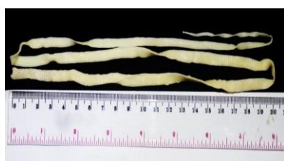
Figure 1. Macroscopic form of Moniezia expansa .