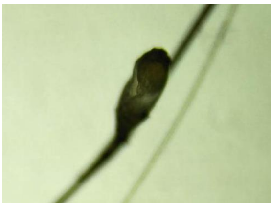
Figure 3. Egg of Pedicinus ancoratus . 40x magnification using a light microscope.

Based on this study, in addition to the adult stage, eggs were also found attached to the body hair of the Javan Langur in the thigh and stomach area. The egg has an operculum, is blackish white and is attached to the hair, this is in accordance with what was said by Taylor et al. (2016). Pedicinus ancoratus eggs can be seen in Figure 3.