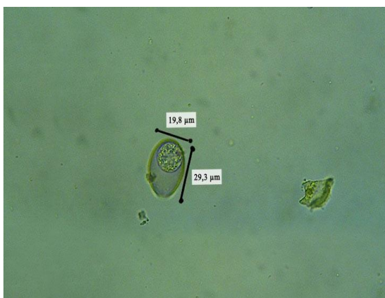
Figure 2. Unsporulated Eimeria sp. oocyst was examined by floating methods (400x magnification)

Blastocystis sp. cyst found in this study measuring 21.3 x 20.1 μm thick-walled, consisting of many vacuoles, having 1-2 nuclei. Having positive single infection in 6 out of 100 samples and mixed infection with Eimeria sp. as many as 8 of 100 samples. Blastocystis sp. can be seen in Figure 3.