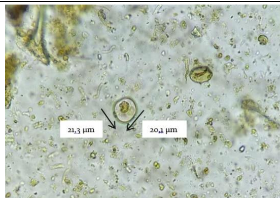
Figure 3. Blastocystis sp cyst was examined by the floating method (400x magnification).

Blastocystis sp. cyst found in this study measuring 21.3 x 20.1 μm thick-walled, consisting of many vacuoles, having 1-2 nuclei. Having positive single infection in 6 out of 100 samples and mixed infection with Eimeria sp. as many as 8 of 100 samples. Blastocystis sp. can be seen in Figure 3.