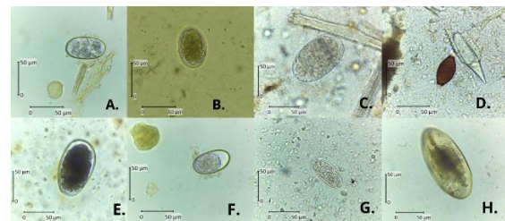
Figure 1. Documentation of Nematode Worm Eggs at KUTT Suka Makmur. A) Oesophagostomum sp., B) Haemonchus sp., C) Mecystocirrus sp., D) Trichuris sp., E) Trichostrongylus sp., F) Ostertagia sp., G) Strongyloides sp., H) Nematodirus sp. (400x magnification)

The identification results of 66 positive samples found eight types of Nematoda worm eggs, namely Oesophagostomum sp. (24%), Haemonchus sp. (20%), Mecystocirrus sp. (13%), Trichuris sp. (8%), Ostertagia sp. (6%), Trichostrongylus sp. (6%), Nematodirus sp. (3%), and Strongyloides sp. (3%) (Figure 1).