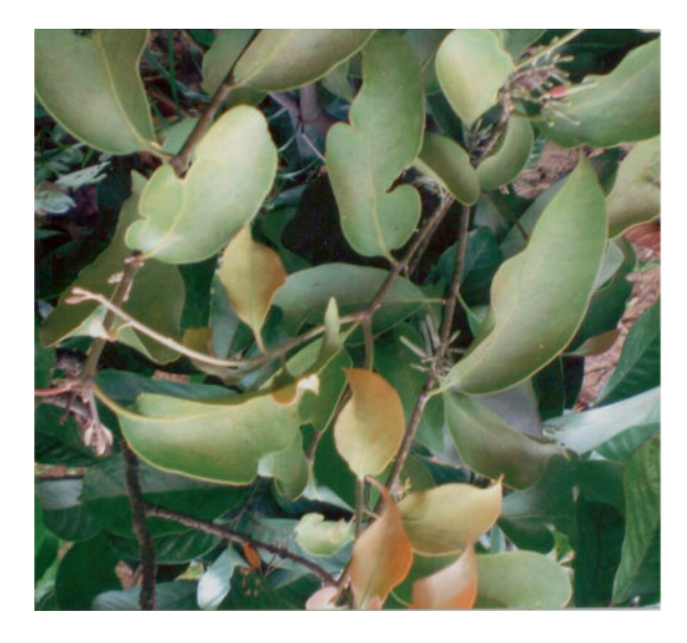
Figure 1 . The leaves of Dendrophthoe species (Benalu duku) from Muara Enim (South of Sumatera island).

Dendrophthoe species (Benalu duku) is a traditional Indonesian herbal remedy which grows to a height of 20 cm to 30 cm (Figure 1). That trees have a some specific traditional name as follows; Pasilan on Depok (Jakarta) and Dendrophthoe on Palembang (South of Sumatera). In vivo and in vitro experimentally, the hot water extract of leaves of Dendrophthoe species were shown have an anti proliferation of myeloma cells. <sup>2,3</sup>