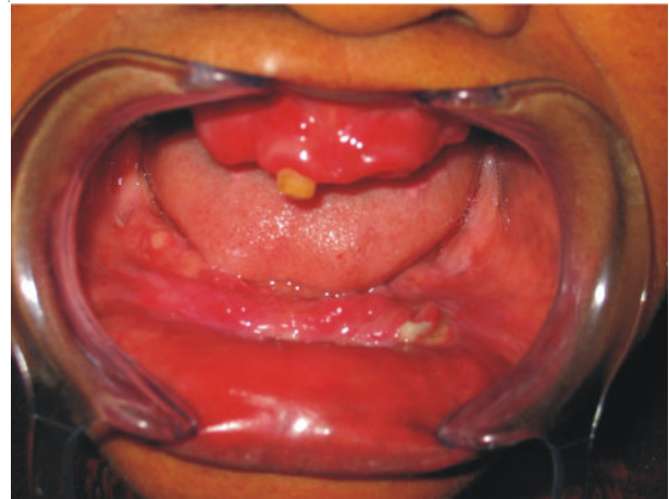
Figure 1. Preoperative situation: the anterior region of the lower jaw presented with flat ridge and narrowed labial sulcus.

The lingual sulcus in posterior region and buccal sulcus were found in between acceptable depth for placing a removable denture, but she had lost the alveolar process, labial sulcus depth in the region of canine to canine. Flabby and movable soft tissue also presented, increasing the denture seated unstable. A labial depth correction was presumed to be necessary to perform by increasing the vertical height and sulcus depth. Panoramic radiography showed a mark atrophied of the anterior region therefore a vestibuloplasty alone would not be enough to ensure the