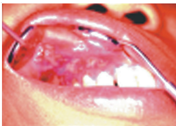
Figure 2. White irregular patch and erythematous base were found on attached gingiva of maxilla and mandibula.

left mandibula and maxilla. The lesion was suspected as thrush and candidal leukoplakia as the differential diagnose. The first treatment was 250 ml oral rinsing containing 1.5% H 2 O 2 and recalled visit on the next day.