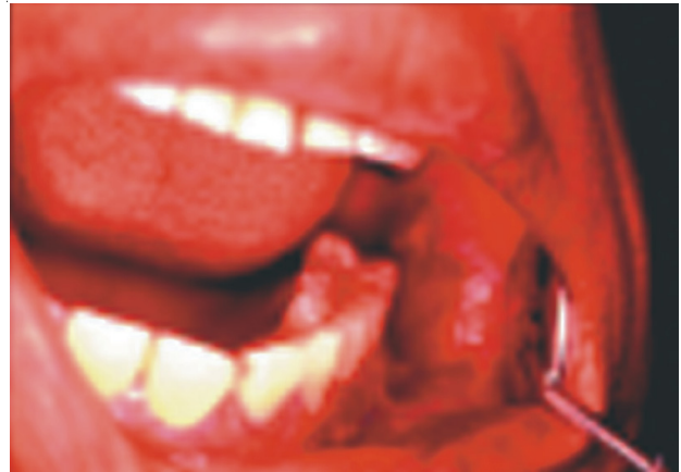
Figure 3. Lace-like white striations on an erythemathous background which unscrappable.

The patient felt better and could eat some various diet, only slight soreness when she ate chilli. The unscrappable lace-like white striae, surrounded by erythemathous area and