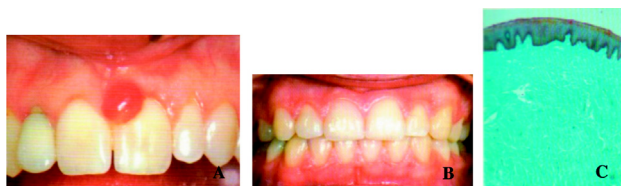
Figure 2. a) Before treatment; b) 4 weeks after treatment; c) The histologic view.

A 15-year-old female came to KPP of Dental Clinic HUSM with the main complaint of gingival swelling in the maxillary anterior region. She had used an orthodontic appliance and it was removed one week before her attendance to Dental Clinic. Gingiva had starting to lump approximately one year ago and gradually increasing it's size. There was no abnormality detected on the extra oral examination. From the intra oral examination, there was a gingival swelling around teeth 11 and 21, it was red and fluctuant consistency (2a), its diameter around 7 mm, with fair oral hygiene. 5 Occlusal relationship in the anterior region was deep bite, with occlusal interference in protrusive movement in the central incisive region. Pocket depth 3 mm around tooth 11. Tooth 12, mesial pocket 3 mm, distal 3 mm, buccal 5 mm, and lingual 3 mm.