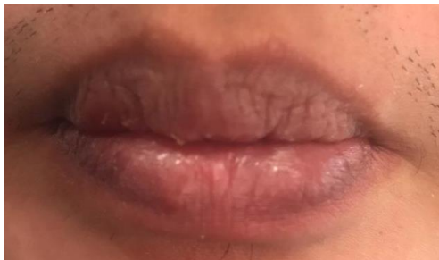
Figure 1. Photograph showing the patient's cracked and peeled lips.

Subsequently, the patient was referred to a medical for a full blood count (FBC) with differential analysis to check for any possible relationship with diabetes or Sjögren's Syndrome and deficiencies of iron, folate, zinc, and group B vitamins. The results came out that the patient was fit and well without any abnormality or deficiencies. Besides, the swab test showed the absence of candidiasis infection, although there is a severe decrease in unstimulated salivary flow rate (0.1 mL per minute) and stimulated salivary flow rate (0.5 mL per minute) according to the spit test that was done. The Challacombe scale of clinical oral dryness shows a score of 6, which indicates moderate dryness of the patient's mouth. Based on the overall clinical and laboratory findings, the differential diagnosis of this patient is BMS secondary to xerostomia due to amlodipine.