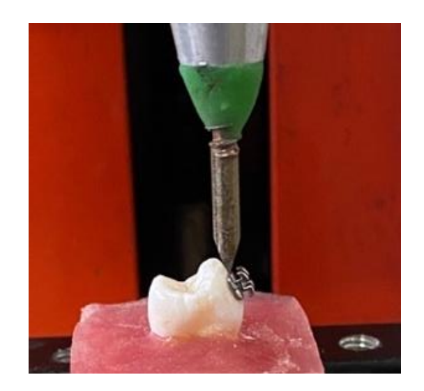
Figure 1. SBS test with a UTM.

The second test is the ARI measurement. The measurement score was obtained through observation with a 10x magnification stereomicroscope (Olympus, Japan). The ARI score was measured using a scale of 1–5 (modified ARI) with a detailed score as follows: 1: All