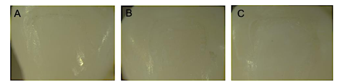
Figure 3. Appearance of the tooth enamel surface after removing the bracket with a stereomicroscope (A: Control group; B: Fluoride group; C: Non-fluoride group).