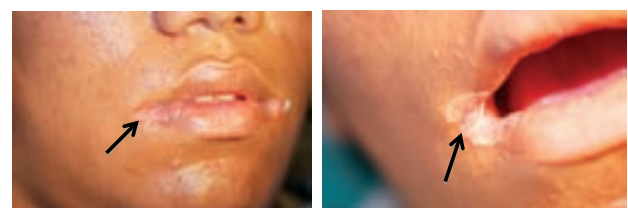
Figure 3. Angular ulcers showed remarkable healing with still desquamation (2 nd visit) the 10 th days.