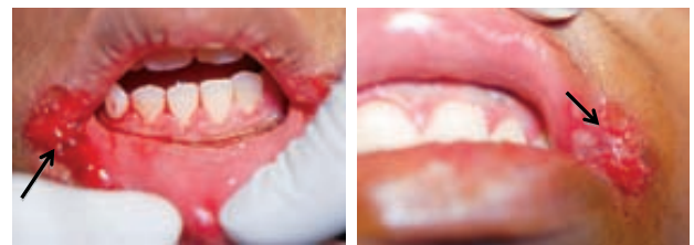
Figure 2. Slight edematous on upper and lower gingival, coexist with multiple minor ulcer on lower lip (1 st visit).