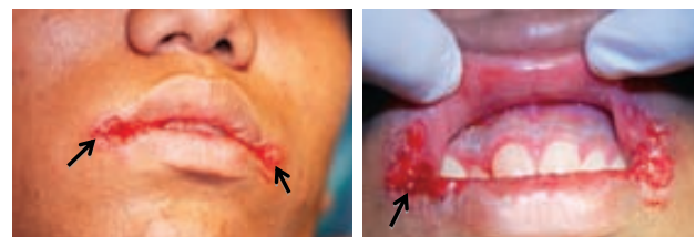
Figure 1. Bilateral chronic multiple angular ulcer covered with red crustae which easy to bleed (1 st visit).

By looking to the clinical manifestation, the angular ulcers in this case cannot be called as a classic cheilitis angularis as the manifestation expressed differently from