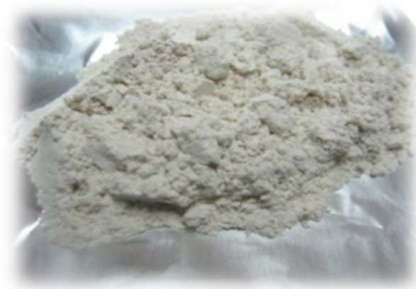
Figure 1. Natrium alginate powder of Sargassum sp .

Maximum water content of natrium alginate which had required by Food Chemical Codex 7 is 15%. The content of natrium alginate in food is at least 13% 8 . According to the research, 9 water content in natrium alginate was in the range between 5% to 20%. Water content of natrium alginate of Sargassum sp was 21.64%. It closed to the range of allowed water content of natrium alginate. There was no significant difference in this data (1.64%). This is because