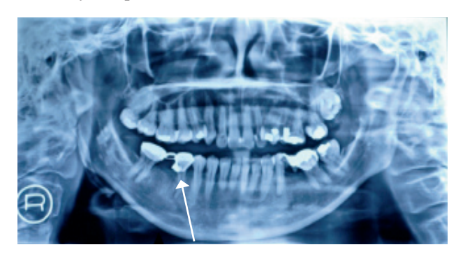
Figure 1. Tooth 45 within crown and bridge before endodontic treatment (arrow).

Since then the term of endo-perio lesion has been used to describe lesions due to inflammatory products found in varying degrees in both the periodontium and the pulpal tissues. The simultaneous existence of pulped problems and inflammatory periodontal disease can complicate diagnosis and treatment planning. An endo-perio lesion can have a varied pathogenesis which ranges from quite simple to relatively complex.<sup>4</sup>