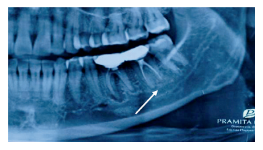
Figure 4. The tooth 36 was diagnosed as an endo-perio lesion. The endodontic treatment showed improper obturation.