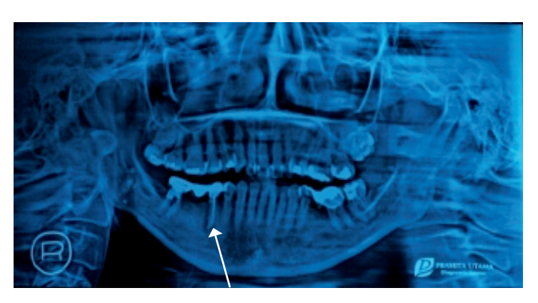
Figure 2. Tooth 45 within a new crown and bridge after endodontic treatment and showed that there was a widening lesion a year forward (arrow).

Two years later, patient reported with a chief complaint about spontaneous pain, swelling, and pus from 45. The