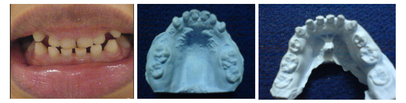
Figure 2. The case of permanent teeth agenesis at 17<sup>th</sup> year old woman.

The pathogenesis of human tooth agenesis is perhaps best understood in anhidrotic ectodermal dysplasias. In this case the molecular pathogenesis and the phenotypes in human patients and mouse mutants are directly comparable. The gene defects in anhidrotic ectodermal dysplasia (Eda), Eda-receptor (Edar), immunoglobulin K-gamma (IKKy) and their mouse homologs, i.e. the signalling ligand, its receptor and the intracellular mediators of the signalling, cause complete inactivation of this signalling pathway. In the mutant mice, incisors and third molars commonly fail to develop and first molars are hypoplastic, while in the patients with anhidrotic ectodermal dysplasia, both dentitions are severely affected and tooth morphology is simplified. The phenotypes of the mice with impairment or over expression of Eda signalling suggest that early defects of ectodermal placodes and, in teeth, the enamel knots would explain the ectodermal defects in human patients. Thus, failure of signalling at an early stage leads to anomalies that are present also in the deciduous dentition. On the other hand, as the mutant and disease phenotypes are caused by complete inactivation of the