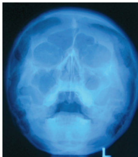
Figure 3. Water's film showing reduced radiolucency of the left antrum with obvious thickening of the antral lining indicating chronic inflammation of the left maxillary sinus. The right antrum appears normal.

nose blowing for one week and she was put on a course of amoxicillin/clavulanic acid 500 mg 3 times daily for 5 days.