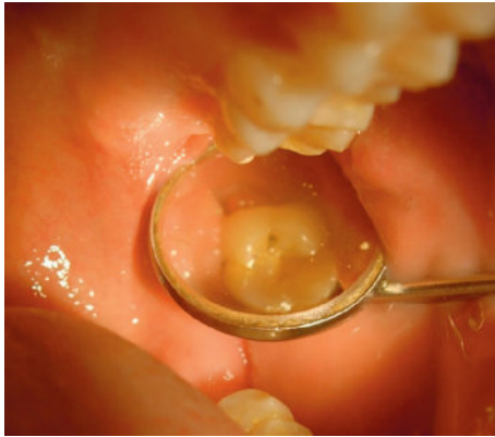
Figure 5. Intra oral examination showing that the fistula opening has closed completely, confirmed by the absence of fluid leakage into the nose upon saline irrigation of the post extraction socket.

Three days later, the wound was surgically closed applying buccal fat pad graft with the overlying mucosa being approximated and held in place with stay sutures to avoid compromising the graft. Nine days after the second closure surgery, however, almost all of the fat pad graft overlying the socket disappeared and the wound opened up again showing some pus coming out from the socket. Irrigation with normal saline to the socket indicated that there was a more obvious communication between the tooth socket and the antrum.