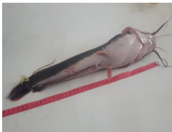
Figure 1. one of the diseased fish sampled.

The bacteria used for the antimicrobial analyses were obtained from samples (gills, kidneys and skin) collected from diseased African cat fish from various farms in Kwara state, Nigeria. The samples were analyzed at the Veterinary Microbiology laboratory, University of Ilorin, Nigeria according to method of Fagbemi et al. (2009). Briefly, 1 g of each sample was pre-enriched in 9 ml of buffered peptone water (Oxoid, Hampshire, UK) incubated at 37 °C for 24 hours. Pre-enriched sample (1ml) was then inoculated into 9 ml of nutrient broth (Oxoid, Hampshire, UK) and incubated overnight at 37 °C. The turbid nutrient broth was subsequently inoculated unto 5 % sheep blood agar (Oxoid, Hampshire, UK) incubated aerobically at 37 °C for another 24 hours. The resultant colonies were purified on nutrient agar (Oxoid, Hampshire, UK) and then subjected to Gram staining and biochemical characterization including oxidase, catalase and coagulase tests (Cowan and Steel, 2002). The isolates were kept in 20 % glycerol broth at -20 °C for future use.