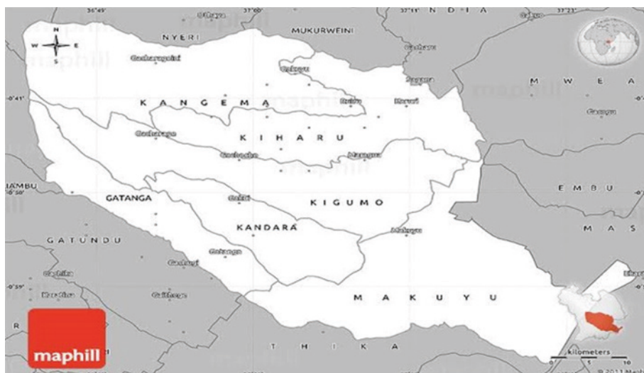
Figure 1. Murang'a County map showing location of Gatanga Sub-County (Murang'a County is the region in white background)

Murang'a is one of the forty-seven counties of Kenya and locates along Kenya's highlands, where the weather and land are favorable for agriculture (Figure 1). Gatanga is one of the six constituencies of Murang'a County, and it locates in the western part of the county. Therefore, the domineering economic activity amongst Murang'a residents is agriculture. People in this region are mainly farmers of coffee, tea, maize, avocados, macadamia, bananas, arrow roots, sweet potatoes, vegetables, among other crops. The majority of the residents keep livestock, mainly dairy cows, traditional chicken, namely kuku kienyenji, broilers for eggs and meat, and goats. To encourage farmers to embrace more modern, profitable agribusinesses, the Murang'a County government put initiatives for the sustenance of agriculture in the region. For instance, milk prices being standardized for 35 KES per liter, also the formation of an avocado farmers' co-operative enabled prices of avocados to rise from 2 KES to 10 KES; the county is also working toward improving coffee standards through the provision of improved seedlings and organic manure at standardized prices (County Government of Murang'a 2018).