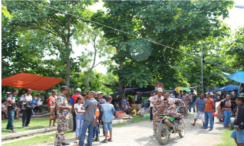
Figure 4. Border market conditions and security guard