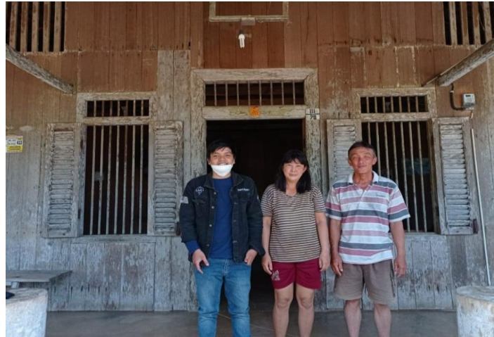
Figure 1. Surviving tin clerk houses

grandfather, which is still beautifully preserved to this day. The area is approximately 500 square meters, with an excessively large courtyard. According to an interview carried out on SAN on March 2021, the original land area is one hectare. A tin clerk usually heads more than 500 contract miners and transports the collected tin products periodically, usually twice a month, to the selling point in Pangkalpinang or Mentok area.