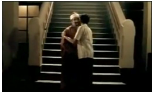
Figure 6. Fahri boarding house