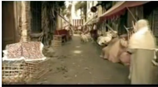
Figure 5. Cockfighting Site

This building is a relic of the Dutch era and has stood since 1904. Previously, this building functioned as the headquarters of the Dutch railway company namely Nederlandsch Indische Spoorweg Naatschappij (NIS). This building consists of three floors with art deco style by the famous Dutch architect, Prof Jacob F Klinkhamer and BJ Queendag. Lawang Sewu is located in the downtown of Semarang which is one of the busiest streets in the city. Literally, Lawang Sewu in Javanese term means a thousand of doors due to the many of door-like windows in that building. People simply perceive them as the building doors despite the actual doors itself do not reach a thousand pieces. Lawang Sewu was neglected for quite sometimes. Until it finally is restored and rebuilt and finished in 2011 ( http://seputarsemarang.com/lawang-sewu-pemuda-1272/ ).