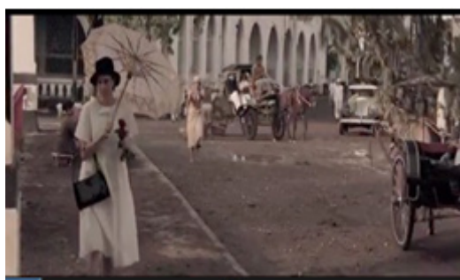
Figure 7. Tunjungan street

This location is set to illustrate of the Tunjungan Street Surabaya in the 1940s and became the opening scene after the title of the movie “Soekarno” appeared. As the opening scene of a movie, it will usually give an iconic message of a movie. In this scene the character first introduced his figure to the audience. The meaning of construction that can be built is as the opening scene Soekarno.