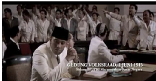
Figure 8. Volksraad Building

In this film, this church is not functioned as its origins, instead it turned out into a Volksraad Building or also known as The Pancasila Building which is located in Central Jakarta, where the trial of BPUPKI was held. The flashback scene about how Indonesia's Independence finally obtained was shown in the minute 02:16:37. This area become an iconic because it is consist of sequence of the history of Indonesian independence. The meaning that can be constructed in this movie is that as a place for the formulation Indonesian independence in the Soekarno the movie.