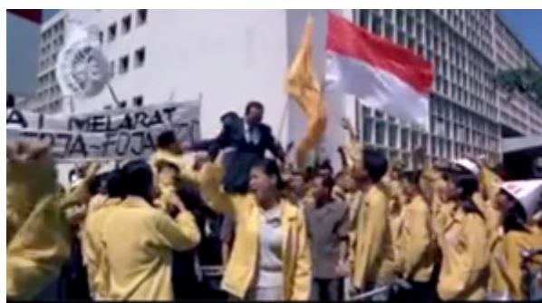
Figure 4. The construction of State Financial Building

This building was burnt in 1954. Thus, they constructed a new building which is currently used as the State Financial Building. It has a Tropical Modern Architecture element and as one of the cultural heritage building which actively used by the local government, especially related to the financial activities, and one of them is the Regional Office of the Directorate of Treasury of Central Java Province ( http://semarangkota.com/01/gedung-keuangan-negara/ ).