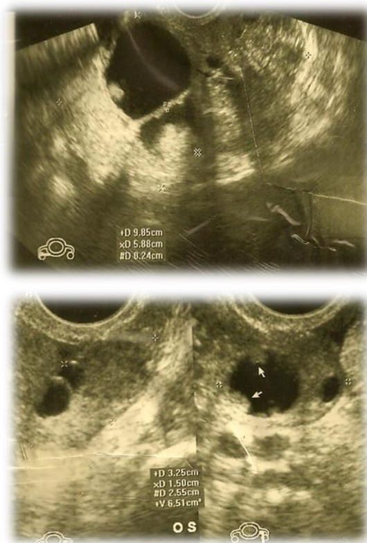
Figure 1. Ultrasound image of ovarian cystic mass with papillary appearance

irregular surface. The uterus and left ovary does not show any abnormalities. Right salpingo-oophorectomy and frozen section were performed and the result was suggestive for stage IIIB ovarian cancer. Frozen section results showed a cystadenocarcinoma, allowing the operator to be more confident in performing the next procedure, namely omentectomy, pelvic lymphadenectomy and appendectomy. There was minimal residual tumor ( <1 cm). Patient was given postoperative chemotherapy consisting of Carbosin 600 mg and epirubicin 160 mg for 6 series. Patient was monitored for 7 years, in which period she has not gotten pregnant yet and no recurrent tumor with Ca-125 value of 1.2 U/ml.