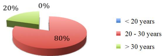
Figure 1. Age characteristics of pregnant women with fetal distress undergoing cesarean section at dr. Soetomo Hospital Surabaya

mostly 20-30 years of age (4 or 80% of all cases), then 1 case of age >30 years (20%) and there were no patients aged <20 years.