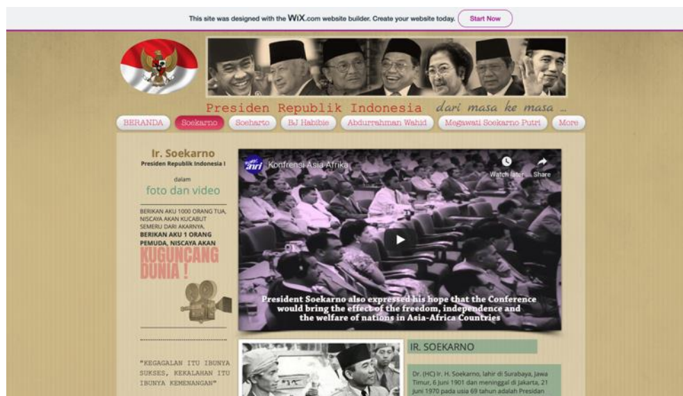
Figure 2. Main Page View President Sukarno (source: Virtual Exhibition site ANRI)

The next section there is a page of President Soeharto, on the part of President Suharto is divided into three sections, namely as the father of development, as Negawaran, and Among the Family. In part as the father of development, this page consists of 22 images are displayed with grid model or collage. In contrast to the photos on pages president Sukarno, each photo gives a brief description at the bottom of the image without having to click the first photo. The photos generally contain about activities or events related to the development as a signatory to the inauguration of a variety of things and when the president Soeharto received a delegation from various countries. In the submenu "As a statesman", on this page only contains five (5) in the form of a collage of photos, each photo should be clicked to view the information and description of the photo. Photos of President Suharto's activity dominated religious holiday. Then in the submenu "Amongst Family", on this page of photos presented in a slideshow, the number of photos displayed amounted to 12 pictures. To see a description of the photos need to click on the first of each photograph. Photo shows President Suharto and his family activities, including the celebration of birthdays, anniversaries, graduations, weddings and other family events.