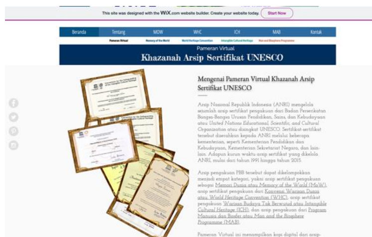
Figure 3. Main Display Themes Archives Resources Resources UNESCO certificate archives

In this virtual exhibition display ANRI digital copies of archival certificate of recognition by the United Nations Educational, Scientific, and Cultural Organization (UNESCO) on natural and cultural richness of Indonesia. The division of the content and navigation of the page exhibition of archives is compiled based on four categories, including Memory World or the Memory of the World (MoW), filing a certificate of recognition from the World Heritage Convention or the World Heritage Convention (WHC), filing a certificate of recognition Heritage Intangible or Cultural Intangible Heritage (ICH), and records the recognition of the Man and Biosphere Program or Man and the Biosphere Program (MAB). The presentation of this virtual exhibition page of each form of slideshow copies of certificates that can be clicked to see the full screen size and more clearly visible information on the certificate. The main view of the virtual exhibition pages as below: