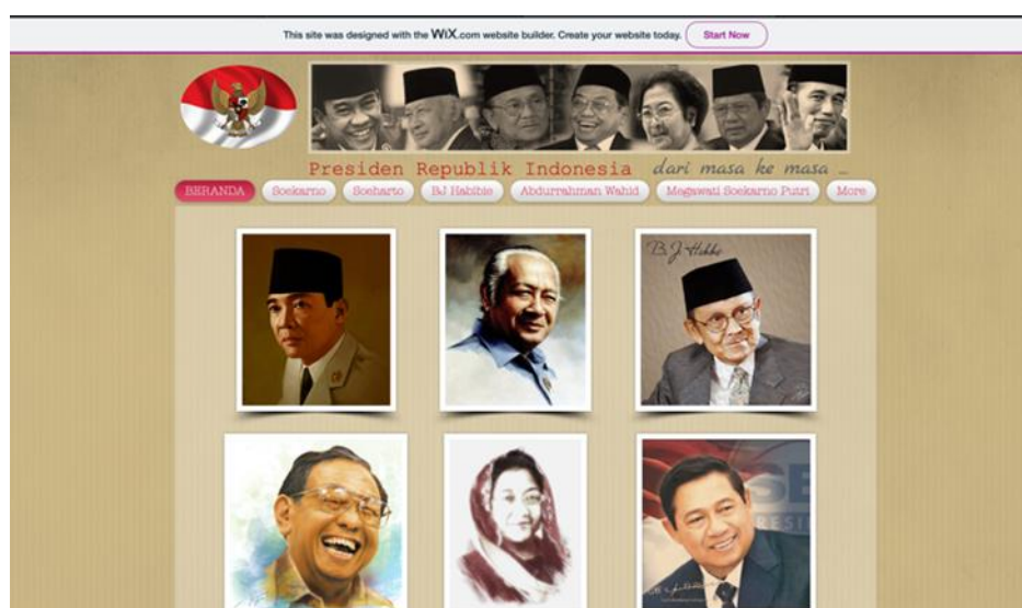
Figure 1. Main Page View Virtual Exhibition

ANRI administered Virtual exhibition, which can be accessed through the site JIKN in https://jkn.go.id , the location of the link to the virtual exhibition is provided on the front page with a choice of two (2) themes, namely Khazanah certificate archives UNESCO and the President of the Republic of Indonesia. It is an unfortunate link text-only, so it does not give an overview to the visitors about what those links and less evocative of visitors, considering the term "virtual exhibition" itself has become prevalent among laymen or user. ANRI can use the Call to Action button to entice visitors to click on the virtual exhibition, CTA is the key characters of writing invites internet users to take certain steps that have been defined as "visited", "download", "click here" and so on. (Georgieva, 2017), One other way is to put a banner display can click through the virtual exhibition on the various websites owned by ANRI. Virtual exhibition sites are administered using wix.com domain which incidentally is free internet service provider domain, it is quite unfortunate, because the big wix banner is still visible on the screen, making it appear less formal and private. As one of the main screen virtual exhibition ANRI is as follows: