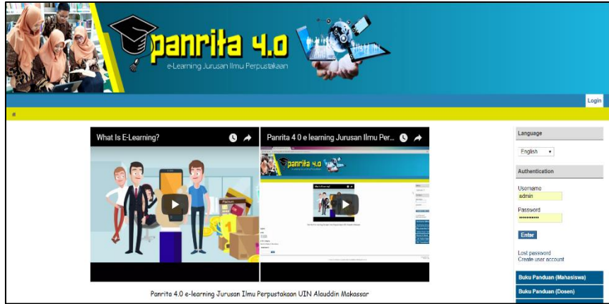
Figure 2: Panrita 4.0 e-learning at the Department of Library Science UIN Alauddin Makassar used Claroline ( http://elearninglis.uin-alauddin.ac.id/ )