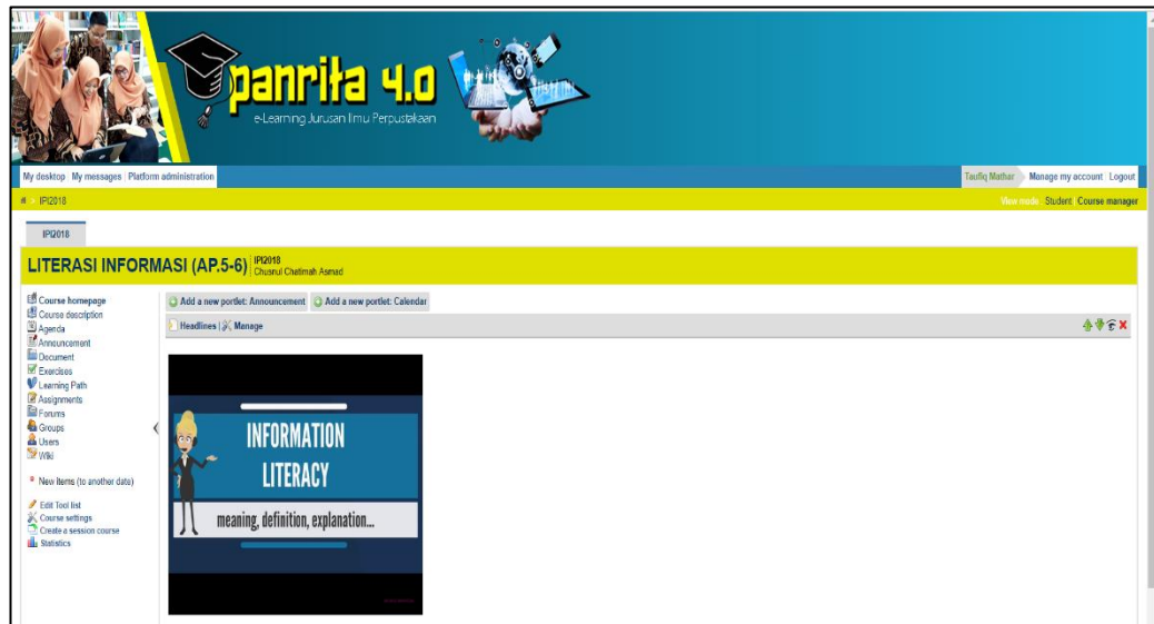
Figure 4: An example of content material that has links to YouTube in Panrita 4.0