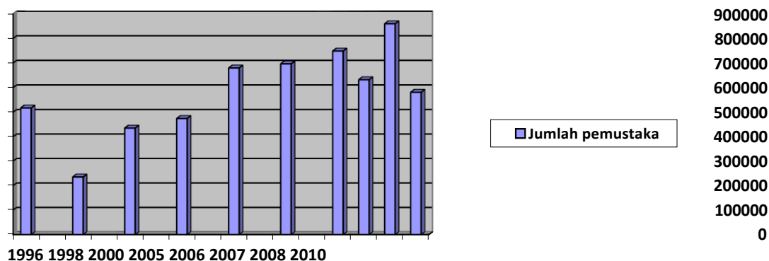
Grafik 1. Jumlah Pemustaka (sumber: Ruang Baca Teknisi Perpustakaan 2011)