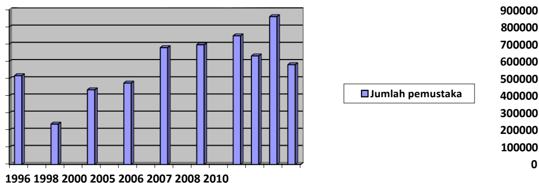
Grafik 1. Jumlah Pemustaka (sumber: Ruang Baca Teknisi Perpustakaan 2011)