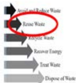
Figure 2. The Waste Hierarchy, Stage 2: Reuse Waste

Moreover, the governments state that these cheap exports also threaten the domestic markets in many developing countries in terms of wages and working conditions and have a crowding-out effect on domestically produced garments. That is: if domestic garment industries in third world countries need to compete with donated bulk imported second-hand garments from the West, they can either further compromise on the quality of the materials or the working conditions and wages of the workers, neither seem to be advisable nor ethical. One could even go as far as to say that driving down the wages of dressmakers in low-income countries to satisfy our compulsion to look smart is misdirected and toxic and decidedly unmoral. It is not surprising that the governments of Uganda, Tanzania, and Rwanda have in recent years started pushing for a ban on the import of second-hand garments from the West to protect their domestic industry. 14 Others state that this is an oversimplified image of reality and that economic liberalisation has also played a role in the cause of the problem. 15 To complete the range of viewpoints, it is also argued that there is a flipside to the ban on second-hand clothes: people do not have the means to afford new clothing and jobs in the second-hand trade, also in the developing countries, will be lost. 16 The second-hand clothing trade provides self-employment opportunities, and there are local economic benefits. 17