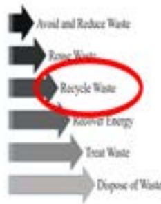
Figure 3. The Waste Hierarchy, Stage 3: Recycle Waste

The next step in the waste hierarchy (see figure 3) is recycling. This means that the fabric is graded into type and colour, the textiles are then shredded into fibres (fiberising), also known as fibre fluff. Depending on the intended use, this fibre fluff is then mixed with other selected (virgin) fibres. This blended mixture is subsequently cleaned and bleached if necessary. 21 The new fibres can be used for different applications. Most of these applications are non-woven fabrics, as the spinning of recycled fibres into yarn is complicated and costlier compared to the non-woven applications. A thorough market analysis from Chang, Chen, and Francis has identified the following suitable product areas for the application of these fibres: carpet cushion, home insulation, fibre stuffing, clean-up products, mattress pads and futons, geotextiles, landscaping, and concrete. 22 These applications are based upon three principles: first, the use of the fibre fluff does not sacrifice the performance of the product it is used in; second, the use of fibre fluff is competitively priced compared to its alternatives; and third, reprocessing is not needed (e.g., cleaning, dyeing, or finishing) except for shredding into fibre fluff. 23