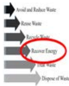
Figure 4. The Waste Hierarchy, Stage 4: Recover Energy

economical viable in mainstream operations. The underlying reasons include that the existing techniques for the collecting and sorting of the clothes into the right fabric and colour separation still need to be improved to be able to compete with virgin fibres. 30 There are innovations in the sorting process that might contribute to a faster and more accurate sorting of the collected textiles by material and colour, such as an automated sorting machine.