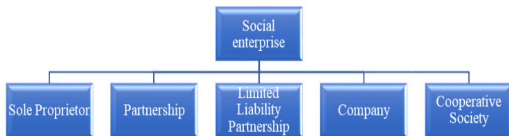
Figure 2. Business Organization for Social Enterprise in Malaysia

According to the findings of the British Council, 43% of people opted to register as private companies limited by shares (Sdn Bhd). This is consistent with earlier findings, according to which 48% of social enterprises were registered in this category. The sole proprietorship registration type was the second most common type of registration (19%). In terms of paperwork and following the law, these two options are regarded as least complicated and burdensome. 15