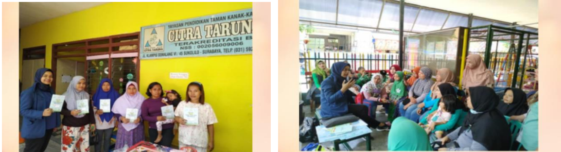
Figure 3.and 4 Training and Empowerment of cadres/mothers about the prevention and management of dental disease or Cegah dan Tangani Penyakit Gigi (Cegatan Pagi).