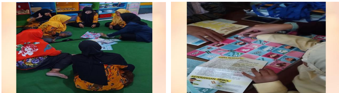
Figure 5 and 6 Self-study through Snakes and Ladders game (Permainan Ular tangga)