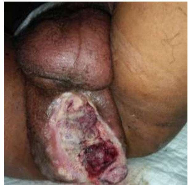
Figure 3. The granulating wound and yellow necrotic

The initial laboratory finding (18/4/2017), found leucocyte 9,8 \times 10^3/\mu\text{L} , hemoglobin 12,4 g/dL, and platelets 70 \times 10^3/\mu\text{L} . Renal function found blood urea nitrogen (BUN) 18 mg/dL and creatinine serum 0,85 mg/dL. Urinalysis result pH 5,5; erythrocyte 5-10 per field of view dan leucocyte 25-50 field of view. The result of urine, blood and pus culture was the same ( Extended-spectrum beta-lactam ) ESBL positive.