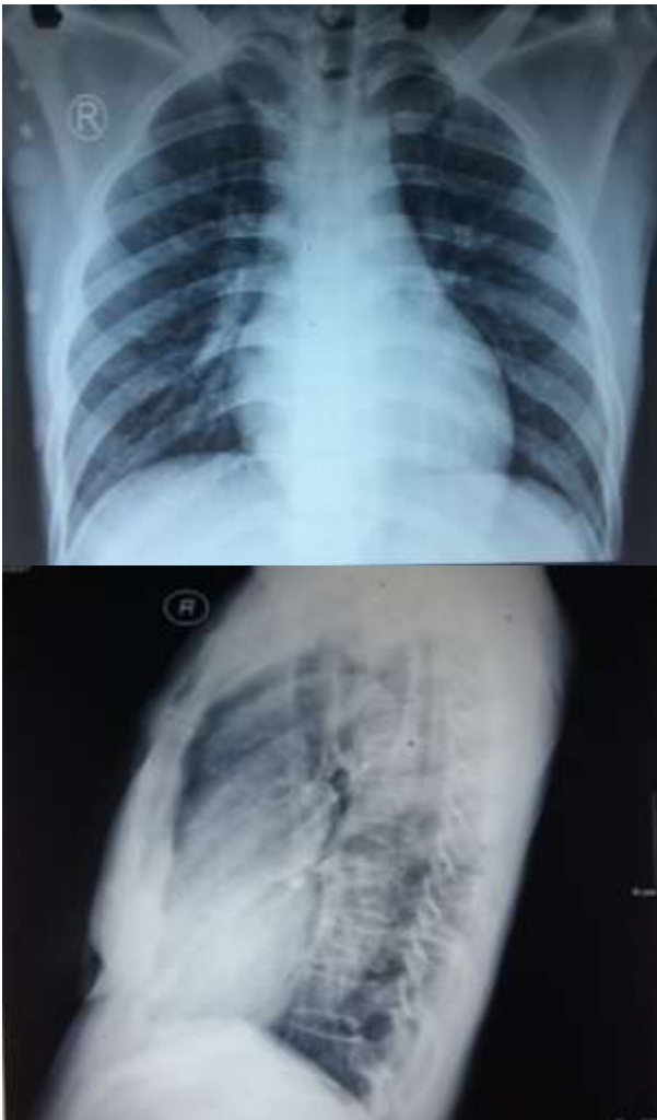
Figure 7. Thorax xray cor and pulmo wihtin normal limit and no sign of metastase

At April 19, 2017 patient underwent evaluation USG (Figure 8) and at April 20th, 2017 patient underwent abdominal CT scan with kontras. From the evaluation USG (Figure 9) we found heterogene solid mixed cystic lesion echogenic with no clear border, ireguler side with size 15,5x8,7x5,6 cm at perineal region and adhere to inferolateral bladder wall with clear border with testis, and other organ within normal limit. From the abdominal CT scand we found slight semi solid enhancement lesion size 15x8x18cm at perineum expand to pelvic cavity, pressing bladder to superior, rectum to posterior, posterior urethra to the left side and air density at the surrounding probably caused by perineum abcess that extend to pelvic cavity (Figure 10).