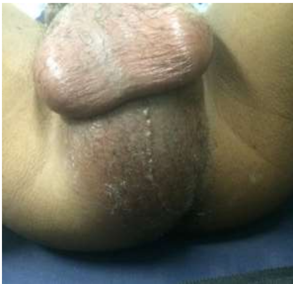
Figure 1. Swelling at perieal region

At April 25, 2017 patient underwent incision and abscess drainage, debridement, necrotomy, and open cystostomy. They collected pus estimatedly 100cc and underwent culture pus swab. After the surgery, found granulating wound and yellow necrotic. At direct rectal examination, the mass seems at the extralumen and fragile.