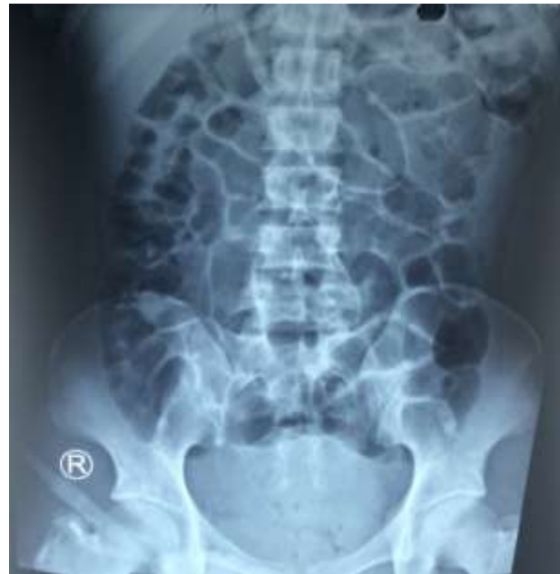
Figure 6. Abdominal xray found ground glass appearance at pelvic cavity