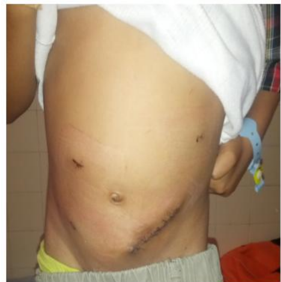
Fig. 8. Post secondary LATEP surgery

After follow-up in 6 months postoperatively, three children were found to recover without complaint, two children who previously suffered enterocolitis, started to improve since the second month post-surgery, but still had recurrent diarrhea with much less frequency than before, and one child had stenosis at anastomosis. Stoma colostomy closure was done in the five months