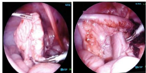
Fig. 3. Transitional zone identification and mobilization via laparoscopy

wound and no complications of infection in the surgical wound.