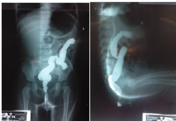
Fig. 2. Overview of transitional zone in patients with examination lapography

All patients were fasted from solid food only for one day and start eating soft foods since the second day. On average, the patients were hospitalized for 12 days, and discharged after day 4 to 4 day 6 postoperative treatment. All patients had no complaints on postoperative