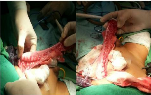
Fig. 5. Freeing stoma for pullthrough preparation

Clinically, there were no signs of systemic infection in all children after the operation, and all children could receive oral intake in post-operative care in the hospital. After their condition was better, they were discharged and observation was done in the clinic in 3-7 days after hospital discharge.