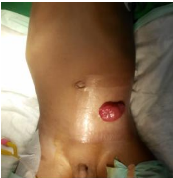
Fig. 1. Stoma has been made prior to definitive surgery

Minimally invasive surgery with laparoscopic technique itself is believed to provide postoperative benefits for the patients compared to open surgery. It is accelerating the timing of oral intake, speed up the discharge of the patient, and alleviating pain (Langer 2012). In Hirschsprung's disease, primary laparoscopic pullthrough techniques was introduced by Georgeson in 1995, to identify a transitional zone, intraoperative biopsy, and mobilize proximal portion of the rectum and sigmoid using laparoscopy. This procedure is followed by endorectal transanal pullthrough (Granstrom et al 2013).