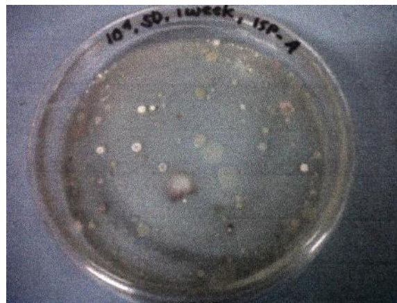
Fig. 1. Mix culture isolates from Sidoarjo Lapindo mud soil samples.

Isolation of Streptomyces sp. was done through several steps. First step was culturing Lapindo mud soil samples from Sidoarjo on ISP-4 media in petri dishes that yielded mix cultures as shown on Fig. 1.